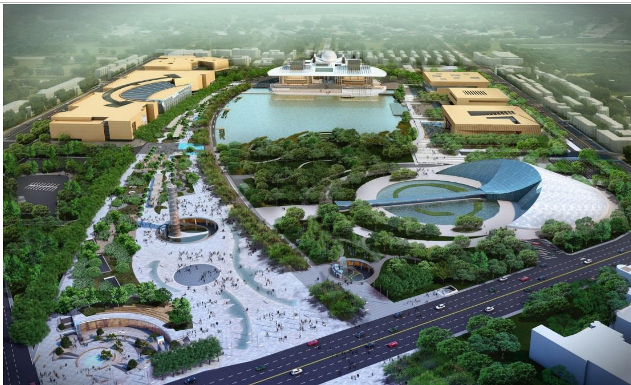
Bird's eye rendering of Tianjin Cultural Park

The aim of water recycling and purifying is to reach class III in national quality standard for surface water. The centre lake will circulate and purify the lake water with a constant rate of 400m 3 /h through skimmers, pipe loop and the processing of cleansing biotope. Besides, the reclaimed water treatment equipment in the treating room will pre-treat the reclaimed water before flowing into the cleansing biotopes and the lake. Tropical control equipment will activate extra P-removal treatment besides the ecological purifying steps. The cleansing biotope is the key design component, including the design of the aquatic plants, filter substrates and pipelines.